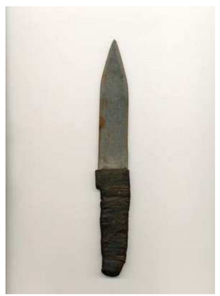
Materials: Iron plate; handle wrapped with electrical tape.