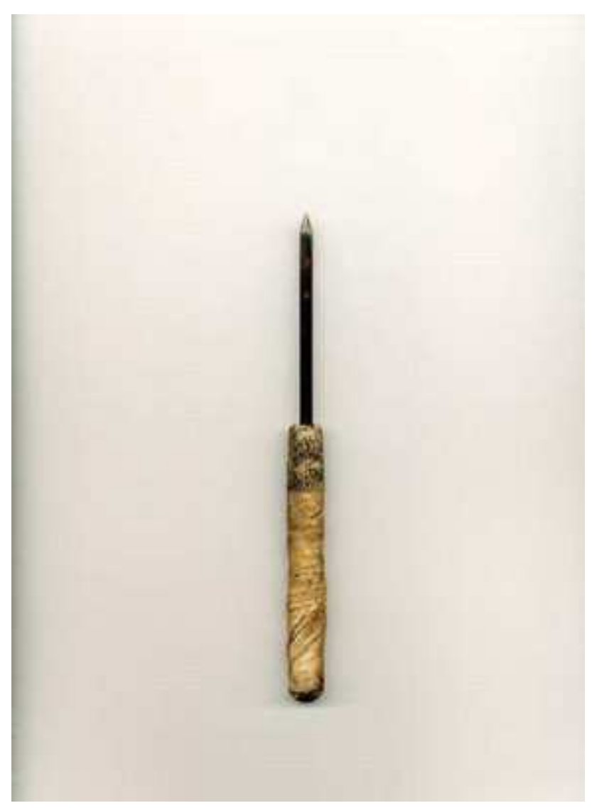
Materials: Steel rod; handle wrapped with boxing tape.